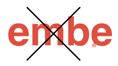
Don't alter the logotype.